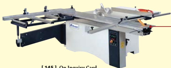
[ 145 ] On Inquiry Card or go to wooddigest.com/productIQ