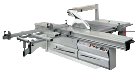
[ 147 ] On Inquiry Card or go to wooddigest.com/productIQ