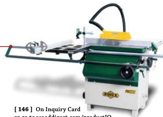
[ 146 ] On Inquiry Card or go to wooddigest.com/productIQ