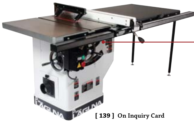
[ 139 ] On Inquiry Card or go to wooddigest.com/productIQ