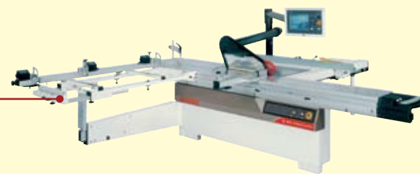
[ 140 ] On Inquiry Card or go to wooddigest.com/productIQ