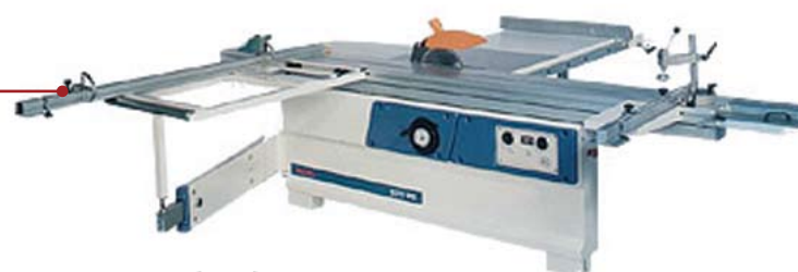
[ 148 ] On Inquiry Card or go to wooddigest.com/productIQ