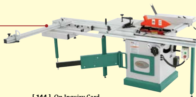
[ 144 ] On Inquiry Card or go to wooddigest.com/productIQ