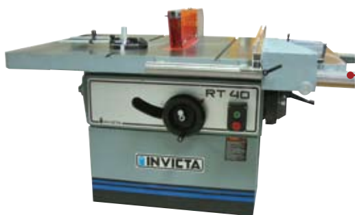
[ 141 ] On Inquiry Card or go to wooddigest.com/productIQ