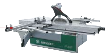
[ 142 ] On Inquiry Card or go to wooddigest.com/productIQ